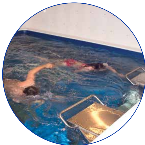
A swimming machine made for two